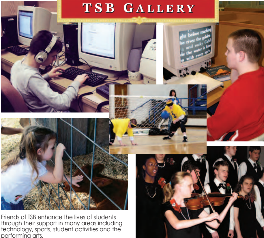
Friends of TSB enhance the lives of students through their support in many areas including technology, sports, student activities and the performing arts.