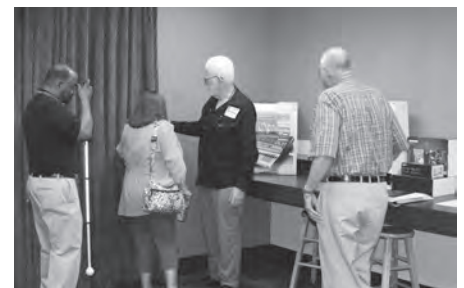
Friends of TSB board members tour the studio.

BOTTOM: During the construction phase the door was relocated to create an accessible ramp for wheelchairs and walkers. A new window was also created.