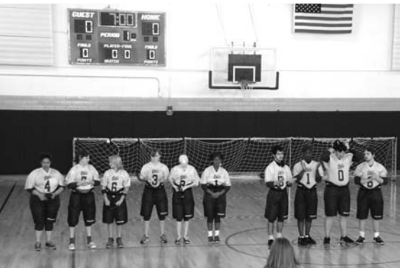
TSB goal ball teams with new equipment and goals purchased through the Predators Foundation grant.